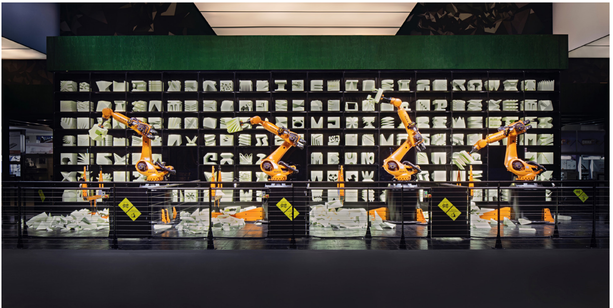
↘ Using ROBOCHOP internet users around the world as well as visitors on site during CeBit 2015 Hanover, Germany were able to design and fabricate a piece of furniture in real time using a web application

Also highlighted was the Robochop project from Kram/Weisshaar that pushed further the idea they had developed in London. Again, using a very simple interface would-be designers could remotely access – via smartphone or laptop – a robotic arm to carve a bespoke sculpture or piece of furniture out of a 50-square-centimeter cube of foam. These efforts show how the world of product design is changing. It is becoming more democratic. Designs can originate from anywhere by anyone so long as they have a networked device and are able to navigate the interface.